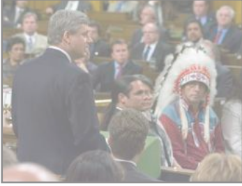
Prime Minister Stephen Harper apologizes on behalf of Canada to Survivors of the Residential School System.